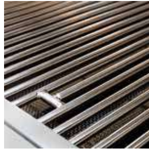
EXPANSIVE GRILLING SURFACE