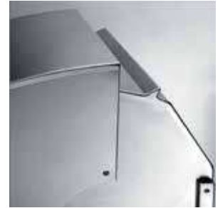
HEAT STABILIZING DESIGN