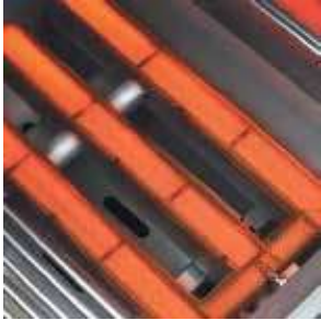
TRIDENT™ INFRARED BURNER

Our unrelenting attention to detail and our passion for innovation have fostered the stunning features that define the Lynx Professional Series. These features begin with meticulous hand-crafted excellence, and they culminate in powerful capabilities that give you precision control.