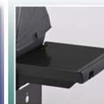
Stylish Steel Side Shelves