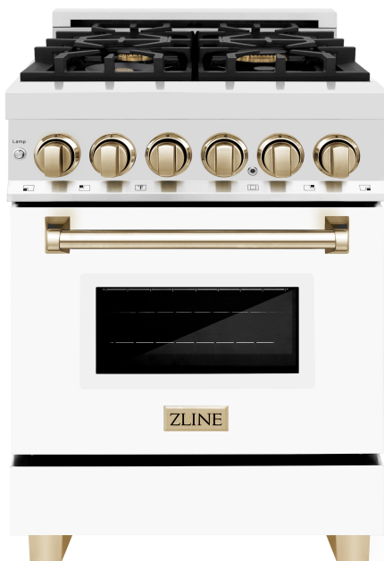
Stainless Steel White Matte Door With Polished Gold Accents