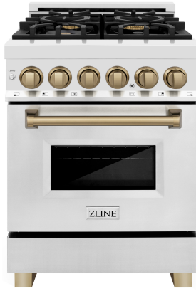
Stainless Steel With Champagne Bronze Accents