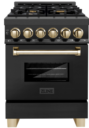
Black Stainless Steel With Polished Gold Accents