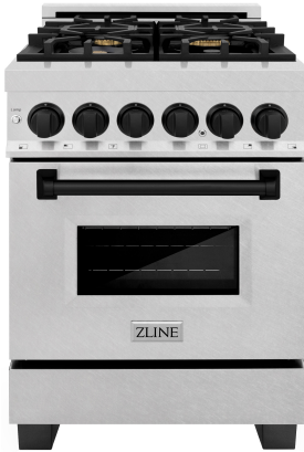
Satin Stainless Steel With Matte Black Accents