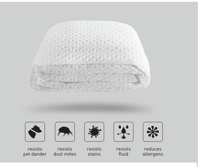
Dri-Tec<sup>®</sup> Performance<sup>®</sup> Sofa Bed Mattress Protector includes a noiseless waterproof barrier that reduces buildup of pet dander, dust mites and allergens to the bed.