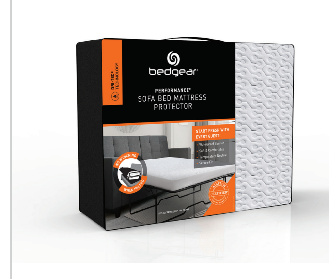
Dri-Tec<sup>®</sup> Performance<sup>®</sup> Sofa Bed Mattress Protector is designed in a white-colored lofted honeycomb pattern for comfort.

Dri-Tec® Performance® Sofa Bed Mattress Protector is designed in a lofted honeycomb pattern and specifically engineered to provide a flexible, secure fit for sofa beds while creating a comfortable night for guest sleepers. Its two-way stretch skirt is flexible and fits mattresses up to 4", allowing the protector not to get caught in the sofa mechanism. BEDGEAR's patented Dri-Tec® technology wicks away moisture to create a temperature-neutral sleep environment.