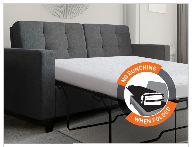
Dri-Tec<sup>®</sup> Performance<sup>®</sup> Sofa Bed Mattress Protector's two-way stretch skirt is flexible and fits mattresses up to 4", allowing the protector not to get caught in the sofa mechanism.