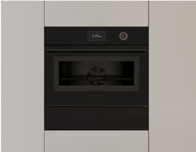
Vacuum Seal Drawer VB24SMB1-SET, paired with Steam Oven OS24NMTDB1