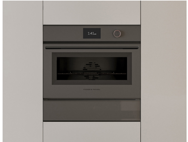
Vacuum Seal Drawer VB24SMG1-SET, paired with Steam Oven OS24NMTDG1