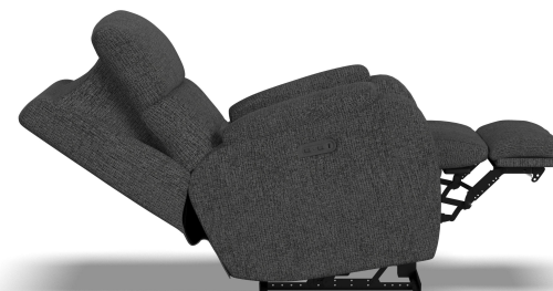
2906-50H in Fabric 197-02