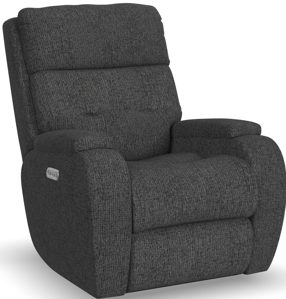
2906-50H in Fabric 197-02