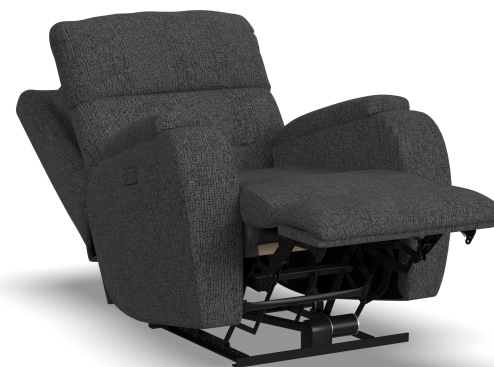
2906-50H in Fabric 197-02