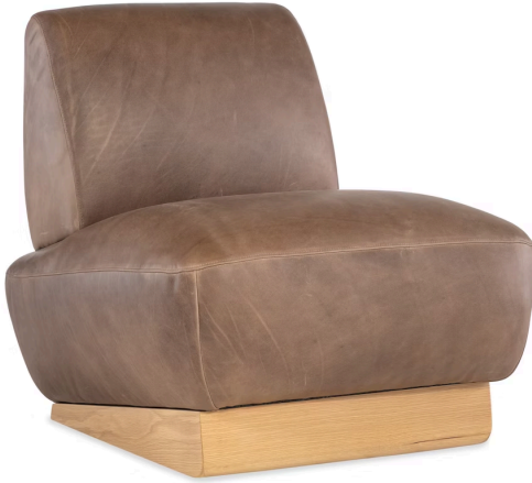
Leather shown: ML1005-88 Finish shown: Natural Oak

Frame Construction: Our M upholstered furniture collection pieces are benchmade from sustainably sourced wood and upholstered start to finish by our skilled craftspeople in both North Carolina and Virginia. Every piece has been thoughtfully designed for today's modern lifestyle. Frames are constructed of sustainably certified kiln dried engineered hardwood. Frame parts are joined with precision cut interlocking joints that are glued, stapled to reduce movement, twisting and warping. Frames have cornerblocks that are glued and screwed at stress points, especially on seat rails and other high stress areas. Depending on rail thickness, frames may be of a hybrid construction, adding a solid hardwood inner frame to give seat rails additional support.