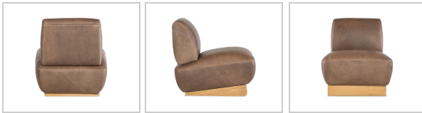
Leather shown: ML1005-88 Finish shown: Natural Oak