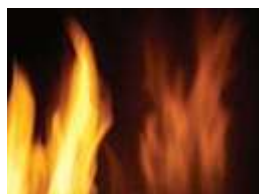
MIRRO-FLAME™ porcelain reflective radiant panels