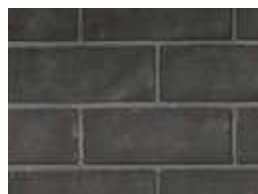
Westminster™ grey standard