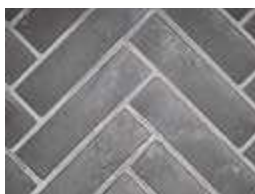
Westminster™ grey herringbone