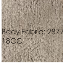
Body Fabric: 2877- 18CC