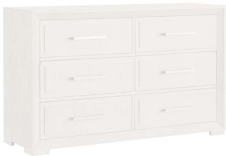
Gramercy Dresser S860DJ-010