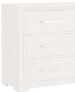
Gramercy Dresser S860DJ-010

See an error on this page? Please report it so that we may correct it.