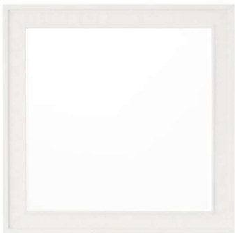
Gramercy Mirror S860DJ-030