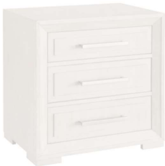
Gramercy Nightstand with USB S860DJ-050