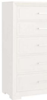
Gramercy Chest S860DJ-040