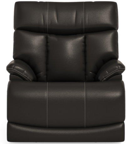
1594-55PH in Fabric 374-00