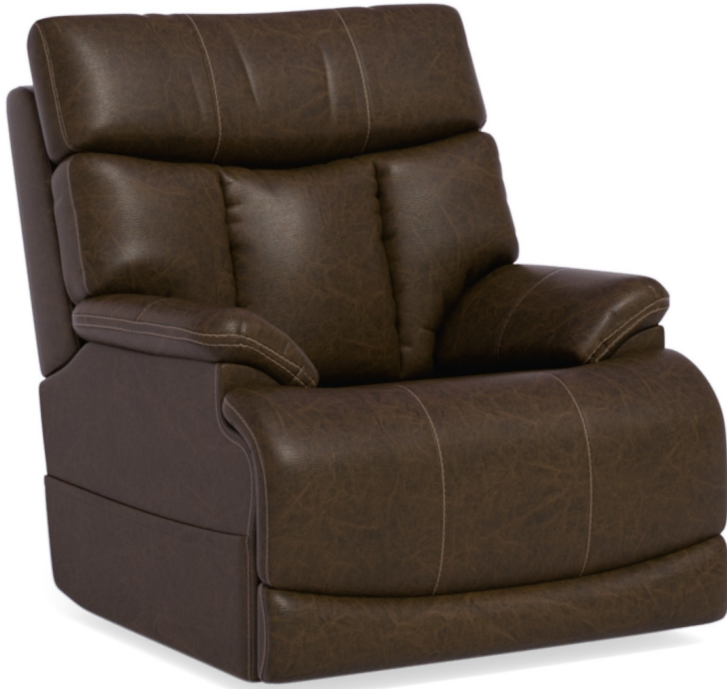
1594-55PH in Fabric 374-70