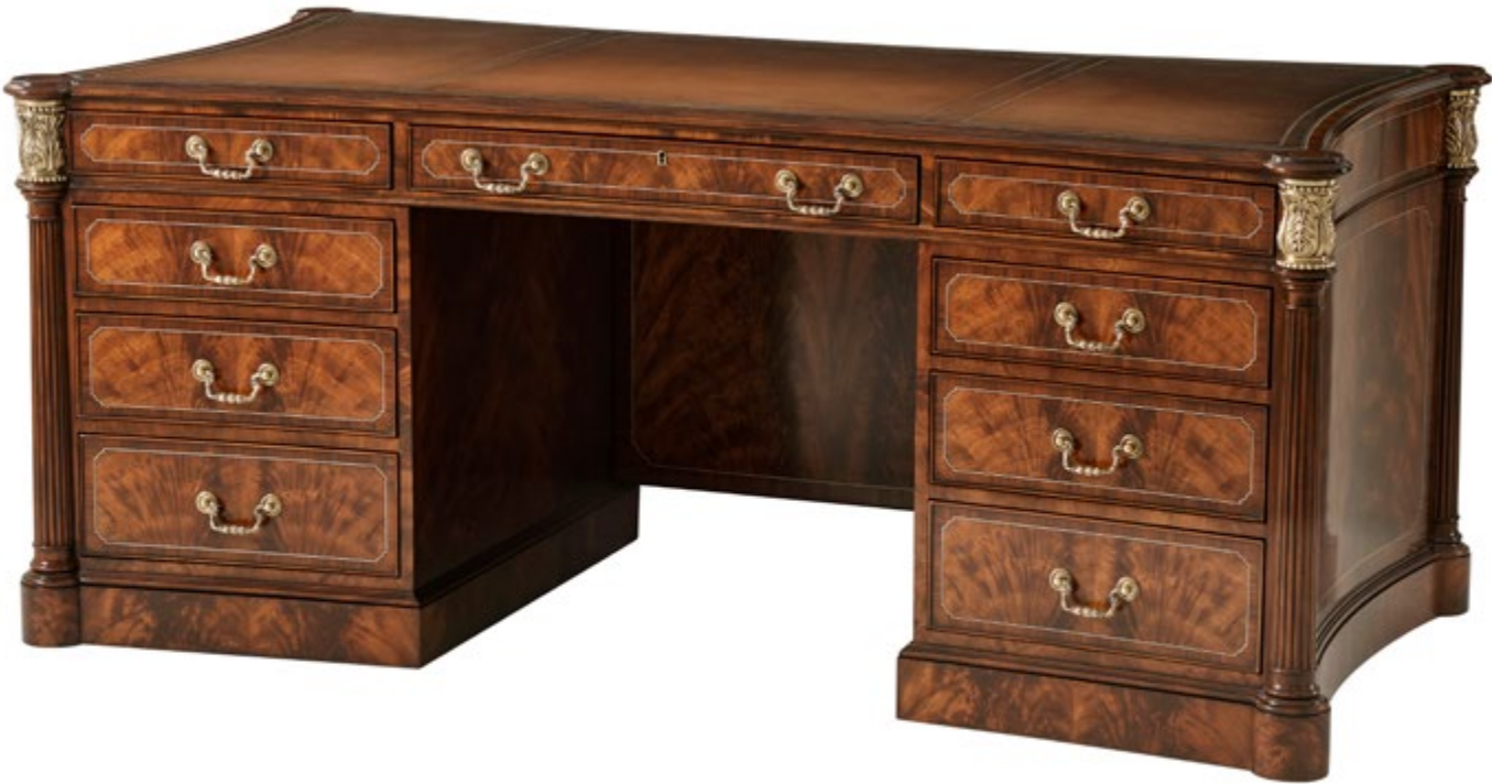
AVENEIL DESK SC71004

A fine flame mahogany veneered and crossbanded pedestal desk with fine double stringing details, the gilt tooled leather inset concave sided top with protruding rounded corners supported by reeded columns with acanthus cast brass capitals, above a central lockable frieze drawer flanked by two further drawer, above pedestals with three graduated drawers each, on a flame mahogany veneered plinth base. The reverse with a modesty panel.