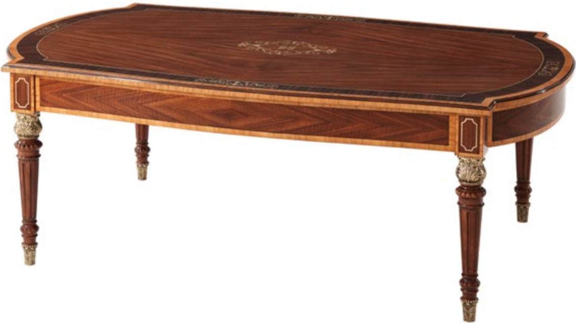
SOPHIE COCKTAIL TABLE SC51001

64 x 42 x 21 in | 162.56 x 106.7 x 53.3 cm