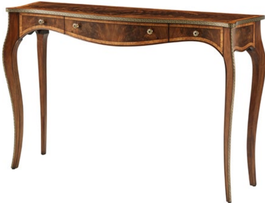
HARPER CONSOLE TABLE SC53020

32 x 13½ x 34 in | 81.3 x 34.3 x 86.4 cm