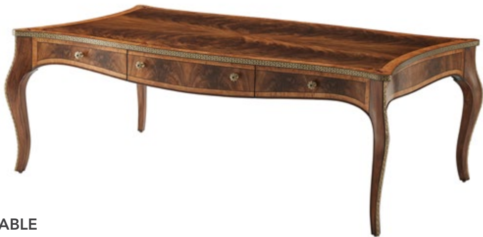
HARPER COCKTAIL TABLE SC51018

The Harper Cocktail Table consists of an elegant Etimoe Crotch, Karelian Burl and makore veneers with beautiful inlaid marquetry woodworking details on top. The frieze patterned drawer and elegant brass pulls provide extra storage. Detailed with sparkling brass inlays, cabriole legs with brass ornaments and pictured here in our Patrician finish.