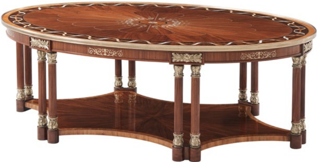
PAULETTE COCKTAIL TABLE SC51011

A very fine mahogany and etimoe veneered cocktail table, the Morado and Movingue crossbanded top with fine stringing and a paper twist marquetry design in sycamore and mother of pearl, inlaid to the center with a bold flowerhead with mother of pearl floral details, bound in brass above a paneled frieze with floral brass accents and brass inlay, on fluted columns with acanthus capitals and bases, joined by a Movingue crossbanded concave sided undertier.