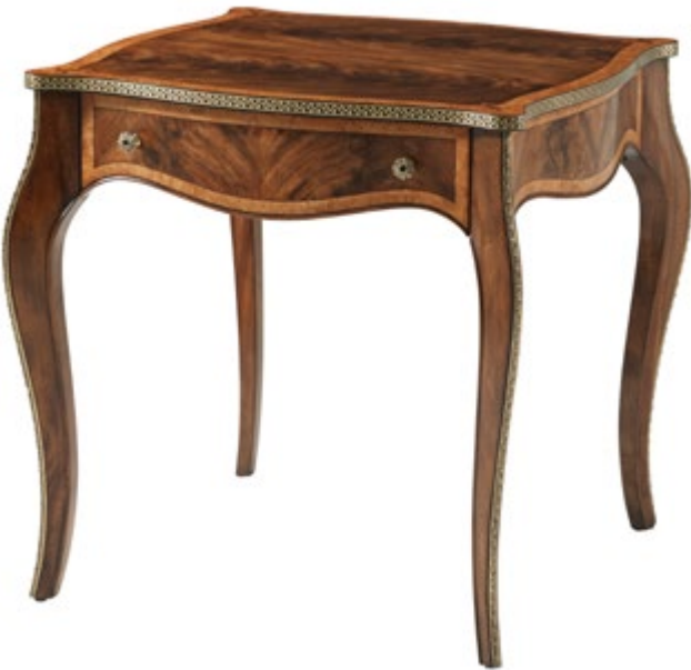
HARPER END TABLE SC50035

52 x 15 x 34 in | 132.1 x 38.1 x 86.4 cm