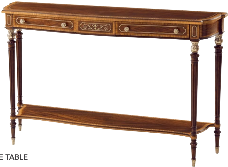
LARGE TOMLIN CONSOLE TABLE SC53001

Serpentine Top with Two Frieze Drawers Brass Floral & Line Inlaid Figured Etimoe Veneer Primavera Veneer Banding Walcot Finish Old English Brass Accents