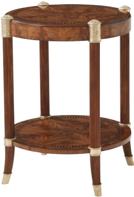
THE VERILY END TABLE SC50033 A flame Cerejeira veneered and parquetry crossbanded side table, the circular caddy molded top centered by an amboyna burl veneered oval, the finely cast brass capital reeded mahogany legs terminating in splayed feet with reeded brass cappings and joined by a parquetry banded undertier. 23 x 23 x 26½ in | 58.5 x 58.5 x 67.3 cm