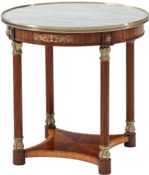
PAULETTE SIDE TABLE SC50027 A very fine mahogany and etimoe veneered side table, the circular Bianco Carrara marble top bound in brass above a paneled frieze with floral brass accents and brass inlay, on fluted columns with acanthus capitals and bases, joined by a Movingue crossbanded concave sided undertier. 26¼ x 26¼ x 26¼ in | 66.6 x 66.6 x 66.6 cm