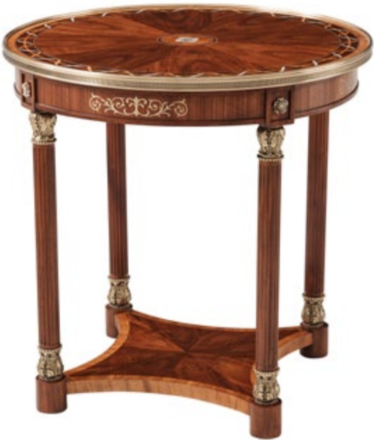
PAULETTE SIDE TABLE II SC50029

56 x 36 x 20 in | 142.2 x 91.4 x 50.8 cm