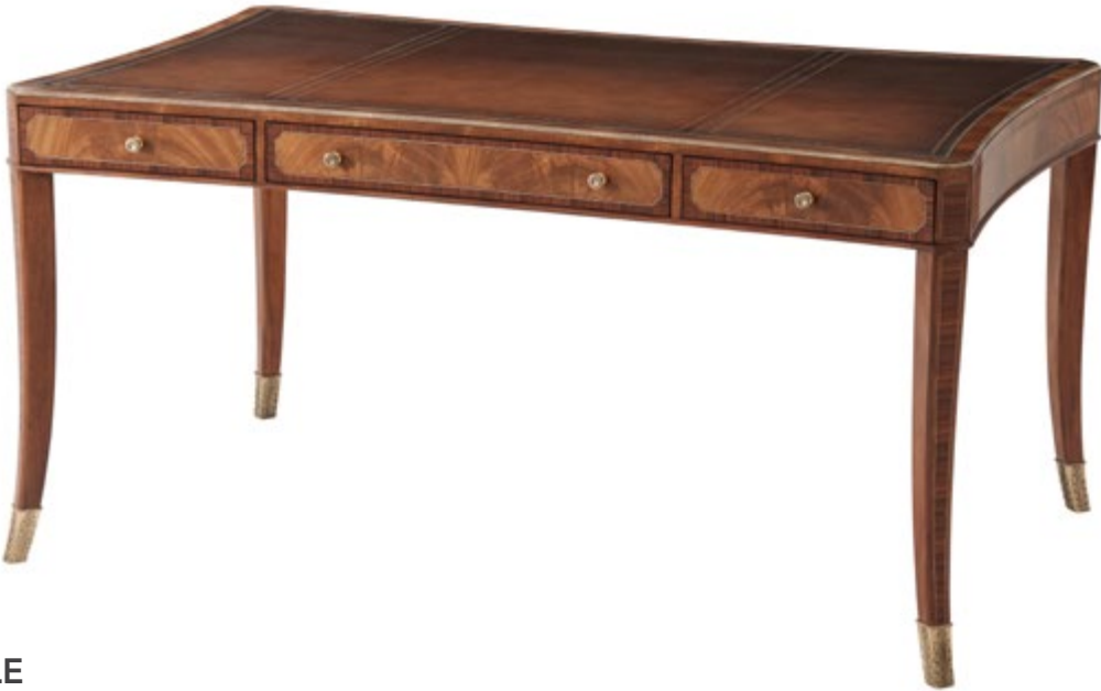
AUDRIC WRITING TABLE SC71006

A fine flame Cerejeira veneered, Morado banded & Sycamore marquetry inlaid writing table, the rectangular concave sided cast brass edged and gilt tooled leather inlaid top with canted angles, above a Morado banded paneled frieze with double stringing and three drawers, on similar sabre legs with acanthus leaf cast cappings.