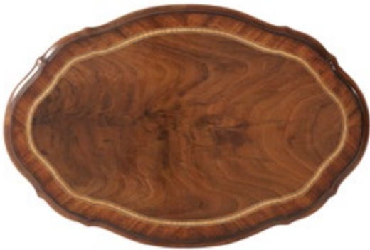
OVAL MILLARD ACCENT TABLE SC50010

An Oxford finish swirl walnut and mahogany banded Accent Table with Primavera and ebonized stringing details, the serpentine molded edge oval top above a shaped frieze on finely acanthus carved cabriole legs joined by a serpentine oval undertier.