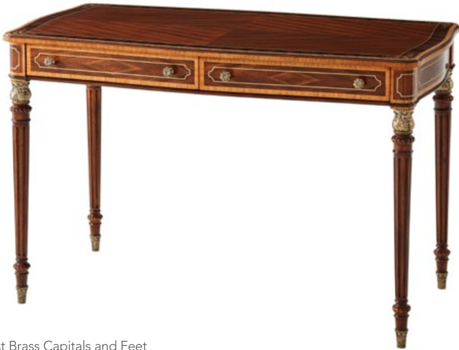
MORLEY DESK SC71002

Two Frieze Drawers Turned & Fluted Legs with Acanthus Cast Brass Capitals and Feet Solid Mahogany & Figured Etimoe Veneer Primavera Veneer Crossbanding Floral & Brass Line Inlaid Walcot Finish with Old English Brass Accents