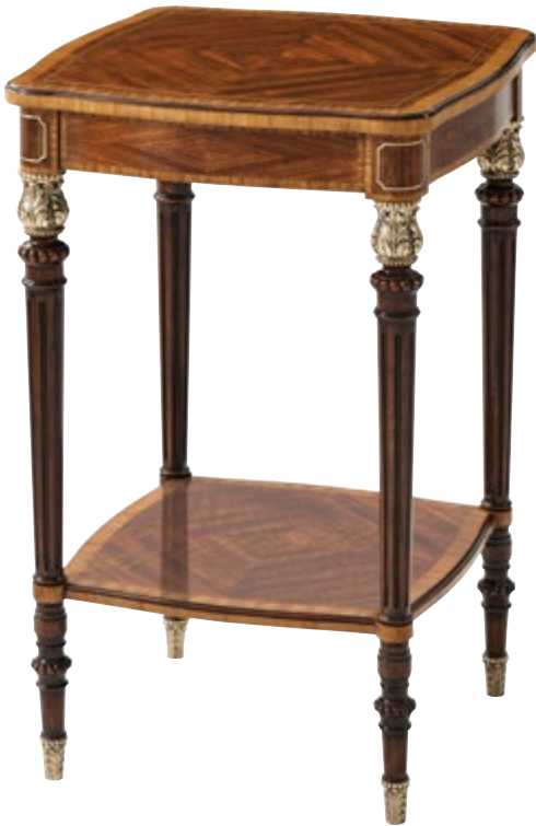
BECKETT ACCENT TABLE SC50002 Solid Mahogany, Etimoe Veneer & Primavera Veneer Walcot Finish with Brass Line Inlaid Details Old English Brass Accents 18 x 18 x 29 in | 45.7 x 45.7 x 73.6 cm