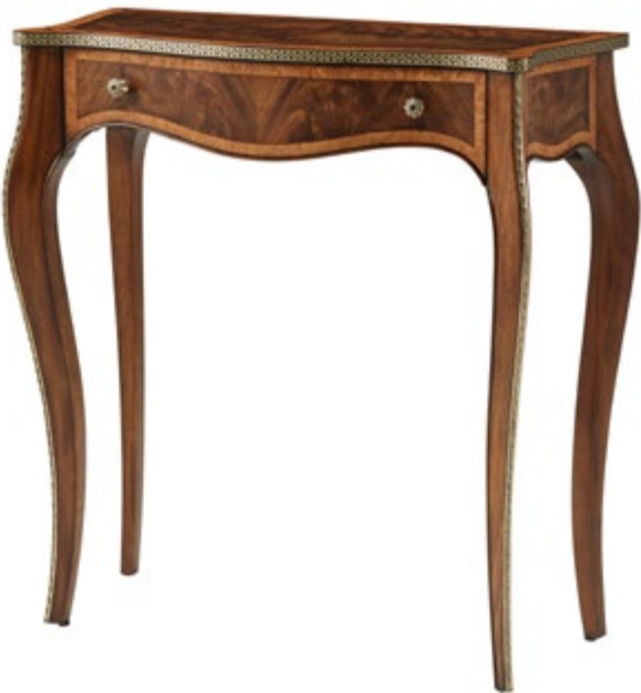
HARPER HALF CONSOLE TABLE SC53021

56 x 33 x 20 in | 142.2 x 83.8 x 50.8 cm