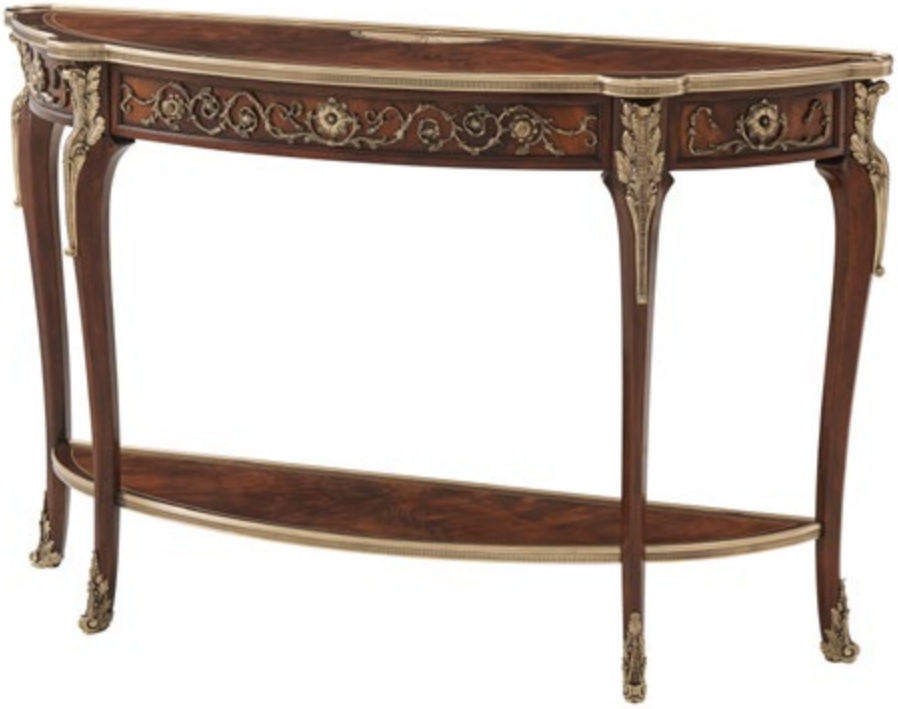
MELINA COSOLETABLE SC53014.C188

72 x 20 x 36 in | 182.88 x 50.8 x 91.44 cm