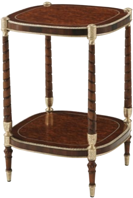
THE TIMOTHY END TABLE SC50032 A fine golden Madrone burl veneered and Morado banded end table, the brass molded top with finely cast and engraved brass capitals and mounts and spiral turned mahogany legs, joined by a brass molded undertier with beveled Glass insert and terminating in turned tapering legs with engraved cast brass toupie feet. 18 x 18 x 26½ in | 45.72 x 45.72 x 67.3 cm