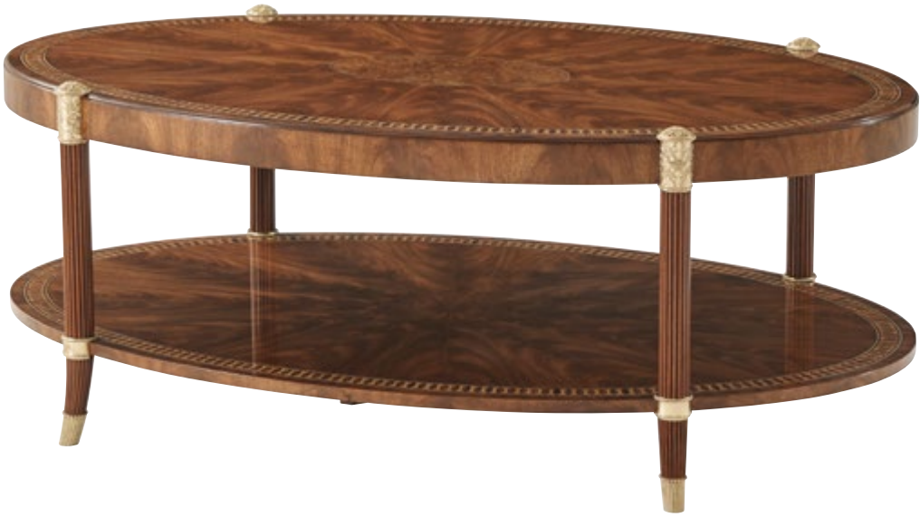
THE VERILY COCKTAIL TABLE SC51014 A flame Cerejeira veneered and parquetry crossbanded cocktail table, the oval caddy molded top centered by an amboyna burl veneered oval, the finely cast brass capital reeded mahogany legs terminating in splayed feet with reeded brass cappings and joined by a parquetry banded undertier. 54 x 34 x 20 in | 137.16 x 86.36 x 50.8 cm