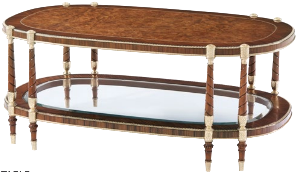
THE TIMOTHY COCKTAIL TABLE SC51016 A fine golden Madrone burl veneered and Morado banded cocktail table, the oval brass molded top with finely cast and engraved brass capitals and mounts and spiral turned mahogany legs, joined by a brass moulded undertier with bevelled Glass insert and terminating in turned tapering legs with engraved cast brass toupie feet. 48 x 28½ x 20 in | 121.92 x 72.39 x 50.8 cm