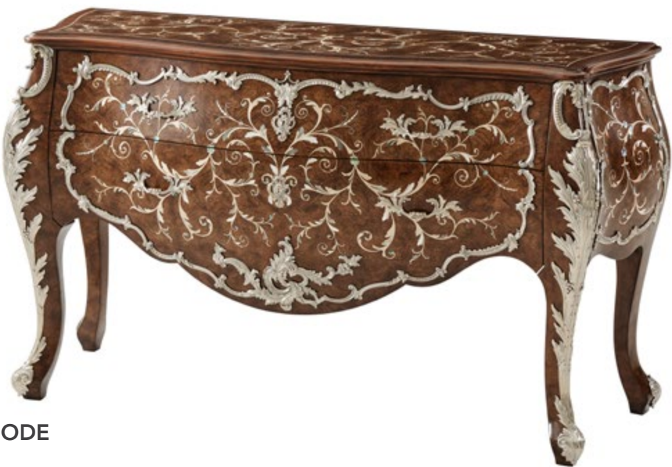
LAURENT BOMBE COMMODE SC60014

54 x 17½ x 34 in | 137 x 44.5 x 86.34 cm