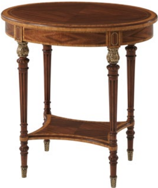
ALERON SIDE TABLE SC50013

26¼ x 26¼ x 26¼ in | 66.6 x 66.6 x 66.6 cm