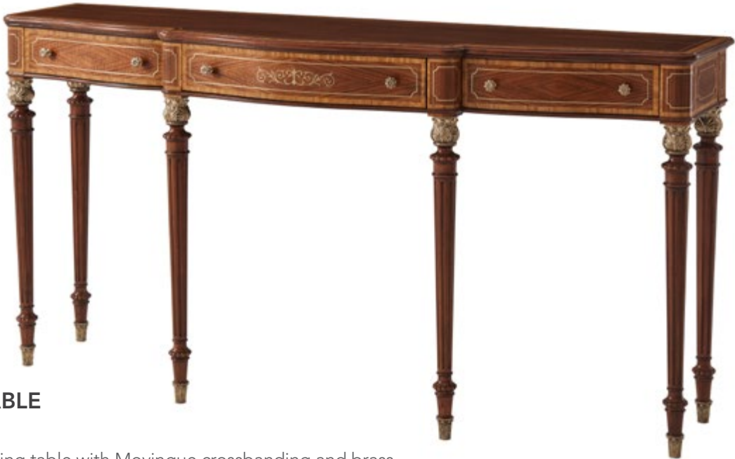
ALERON SERVING TABLE SC53008

54 x 14½ x 34 in | 137.1 x 36.9 x 86.4 cm