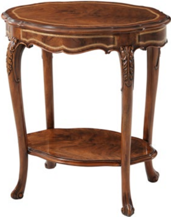
MILLARD ACCENT TABLE SC50011

An Oxford finish swirl walnut and mahogany banded Accent Table with Primavera and ebonized stringing details, the serpentine shaped edge top on a finely acanthus carved and segmented column, on 'S' scroll veneered and strung legs.