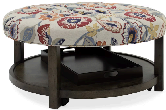
Fabric shown: 300349-00 Finish: Weathered