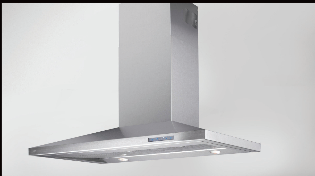
Wall Mount Hood