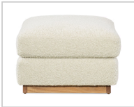
Fabric shown: MB014-04 Bryan Parchment Finish: Natural Oak