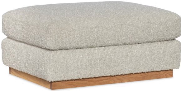
Fabric shown: MB014-04 Bryan Parchment Finish: Natural Oak