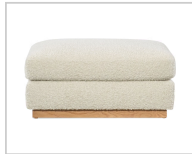
Fabric shown: MB014-04 Bryan Parchment Finish: Natural Oak