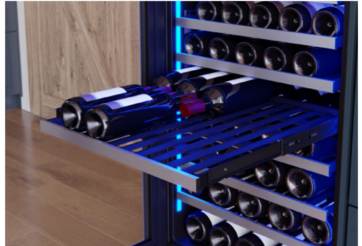
Full-Extension Wood Racks