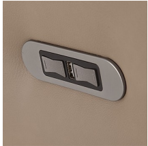
POWER BUTTON WITH USB CHARGER