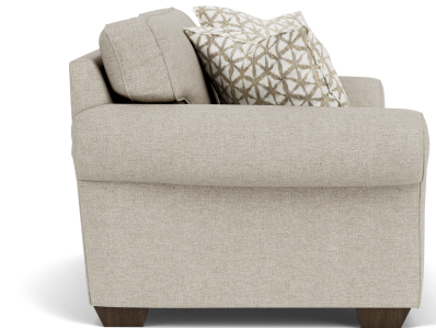
7305-20 in Fabric 818-01