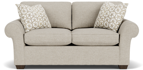
7305-20 in Fabric 818-01