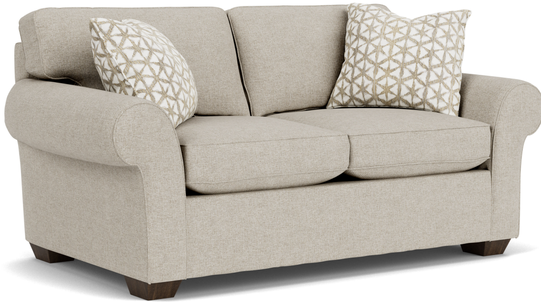
7305-20 in Fabric 818-01