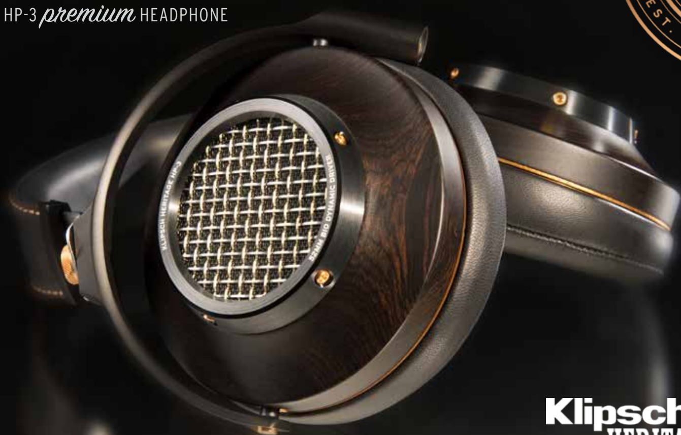
HP-3 premium HEADPHONE