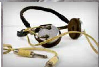
Founder Paul W. Klipsch and his first headphone audio experiment, 1919