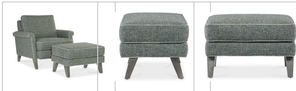
Fabric shown: 409400-45 Contrasting Inverted Welt: 927200-92 Finish shown: Stone