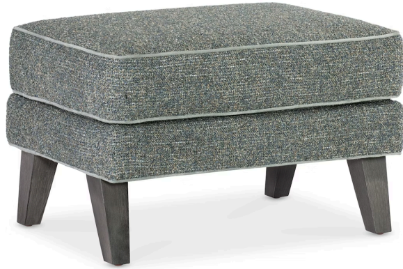
Fabric shown: 409400-45 Contrasting Inverted Welt: 927200-92 Finish shown: Stone