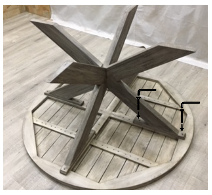
Insert and tighten Allen bolts with the Allen key to fix the base onto the top section. Repeat step for all the other legs.