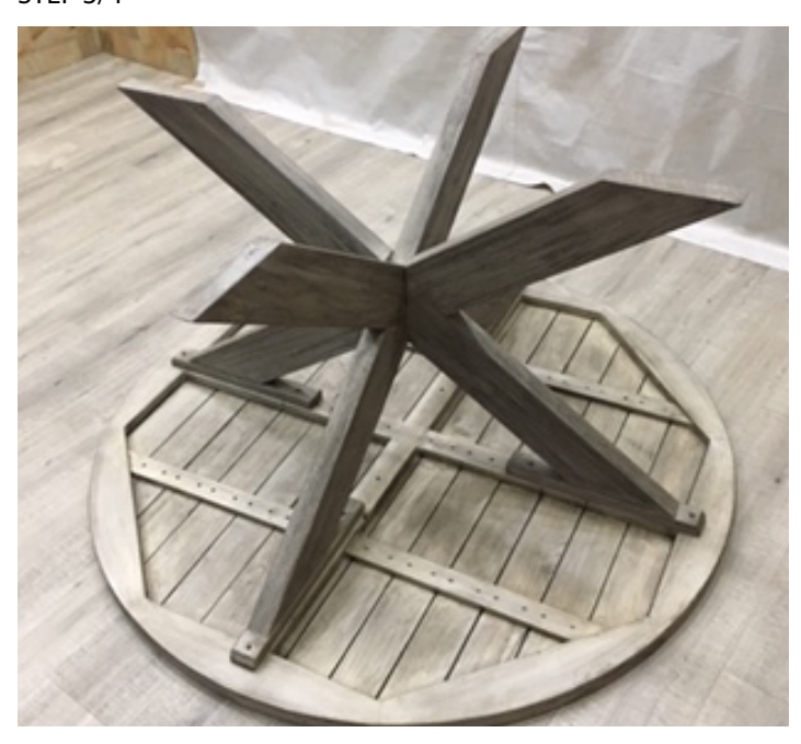
Place and align the base section on top of the top section.