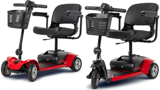
Rascal® Venture is available in both 3 and 4-wheel models.

SWIFT RELEASE TECHNOLOGY provides a quick way to transport your Venture scooter in the trunk of your vehicle in just a few simple steps.