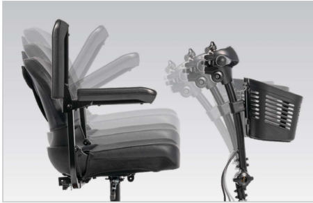
Maximize your comfort with flip-up armrests, adjustable tiller, and seat height adjustment.