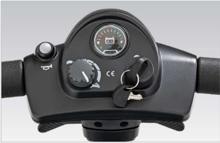
Intuitive controls include horn, speed adjustment, battery meter, key switch, and forward/reverse throttle.