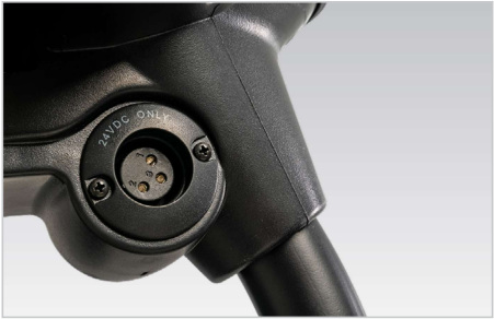
Recharging the Venture is fast and easy with the charging port located conveniently below the right handlebar.