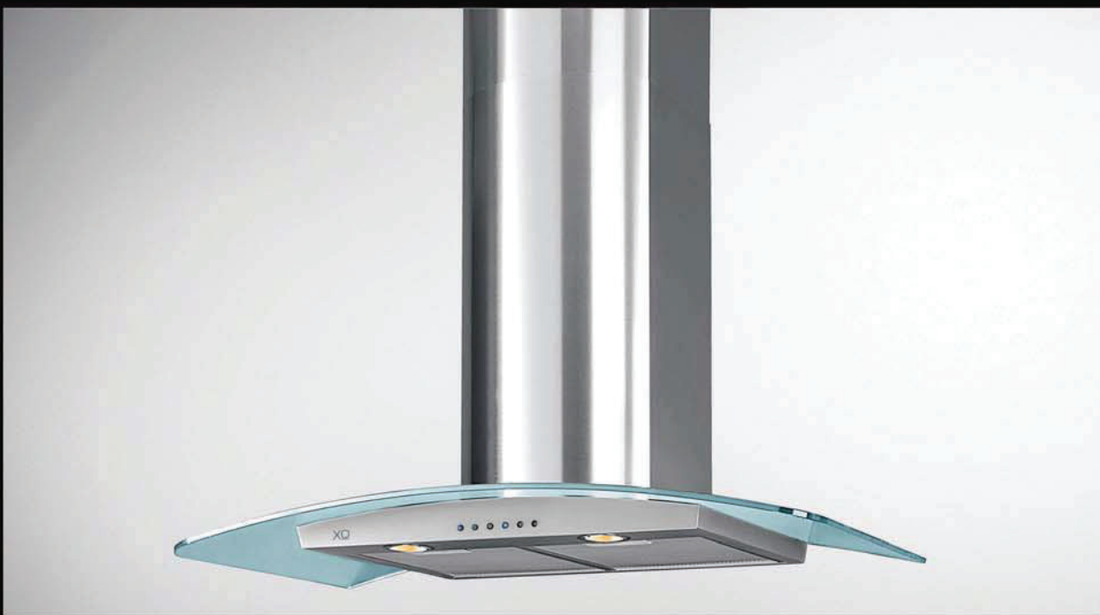
Wall Mount Hood