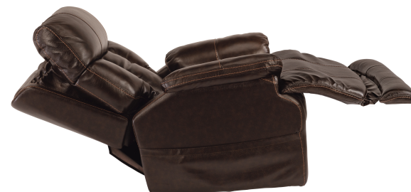
Leather Power Recliner with Power Headrest 1595-50PH in 375-70