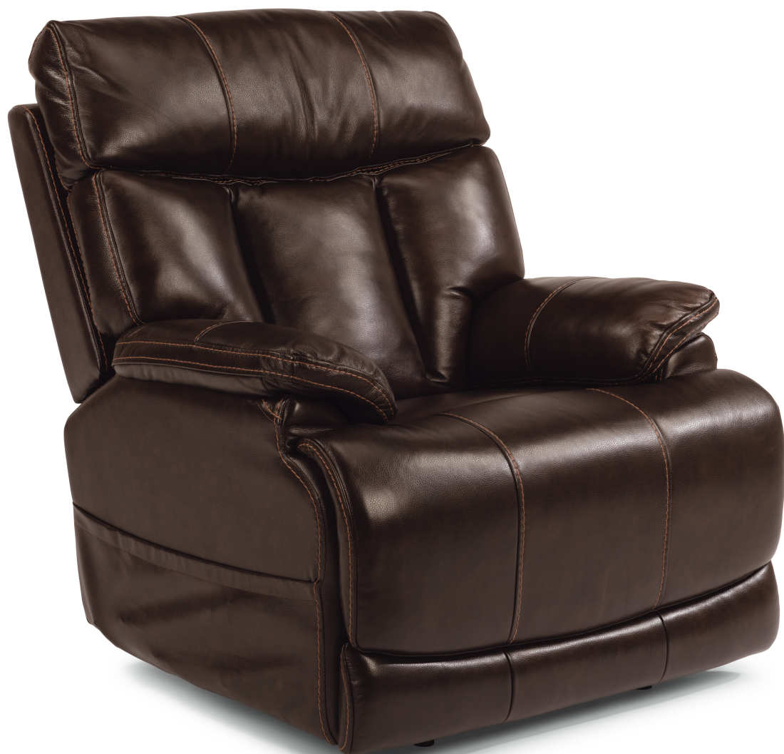
Leather Power Recliner with Power Headrest 1595-50PH in 375-70