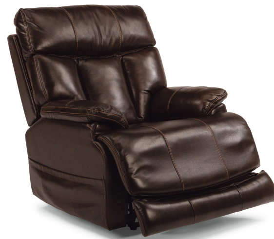
Leather Power Recliner with Power Headrest 1595-50PH in 375-70