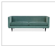
Fabric shown: MV026-28 Viv Forest Finish: Ebony