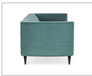
Fabric shown: MV026-28 Viv Forest Finish: Ebony