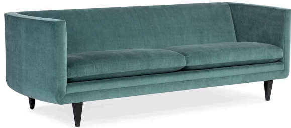
Fabric shown: MV026-28 Viv Forest Finish: Ebony