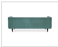
Fabric shown: MV026-28 Viv Forest Finish: Ebony