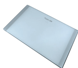
L4 Glass chopping board