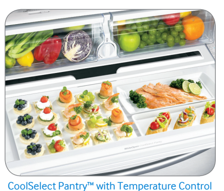
Coorselect Pantry with remperature cont