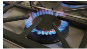
SEALED BRASS BURNER Restaurant-quality performance.