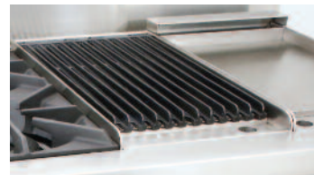
BBQ GRILL Capital's indoor commercial quality grill system.