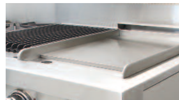
THERMO-GRIDDLE™ Improve your indoor cooking experience and make outstanding meals on the Capital stainless steel Thermo-Griddle™.