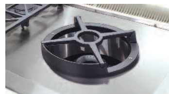
POWER WOK Fabricated cast iron porcelain coated, two-piece wok grate, accommodates a variety of Wok sizes and stockpots.