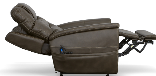
1916-55PH in Fabric 039-01