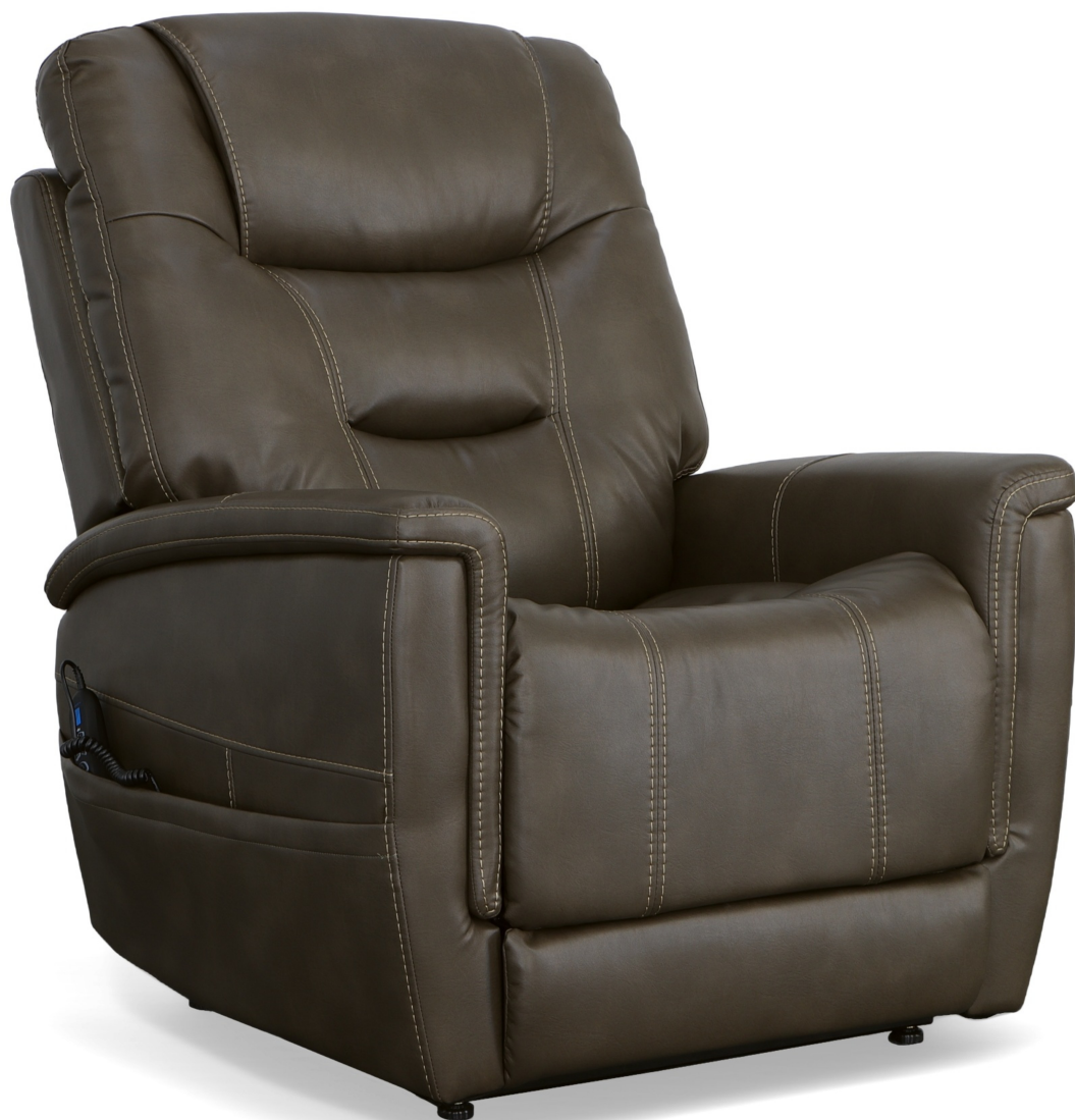
1916-55PH in Fabric 039-01