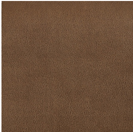
Russet 500-74 Fabric

Printed samples may vary from actual swatches. Please refer to swatches for actual color.