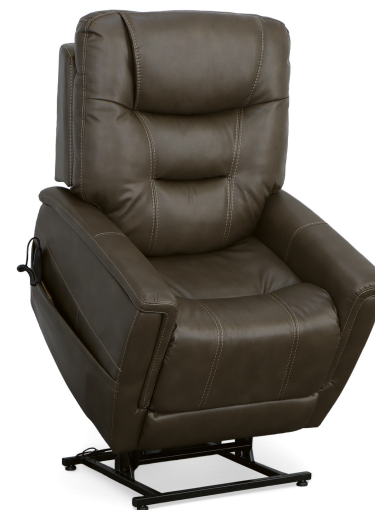
1916-55PH in Fabric 039-01