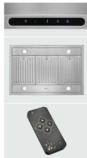
Optional HCR4 Remote Control.