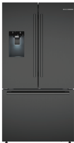
B36CD52SNB Black Stainless Steel

500 Series – Black Stainless Steel B36CD52SNB