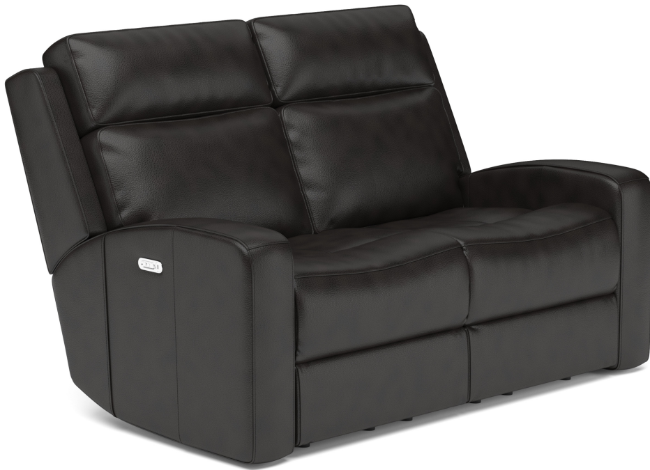
1820-60PH in Leather 297-02