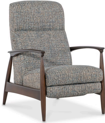
Fabric shown: 400703-45 Finish shown: Palisade Dark