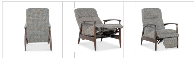
Fabric shown: 400703-45 Finish shown: Palisade Dark