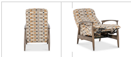
Fabric shown: 700191-84 Finish shown: Fossil Fabric shown: 700191-84 Finish shown: Fossil