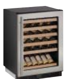
STAINLESS FRAME (LOCK)