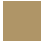
Polished French Gold