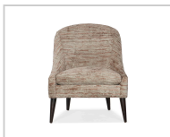
Fabric shown: MH029-53 Toby Cipria Finish: Perk