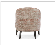
Fabric shown: MH029-53 Toby Cipria Finish: Perk

Finish Construction: M utilizes a multiple-step finish process of up to 16 finish steps. This results in an unsurpassed clarity, depth and color