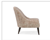
Fabric shown: MH029-53 Toby Cipria Finish: Perk