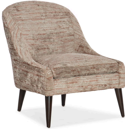
Fabric shown: MH029-53 Toby Cipria Finish: Perk