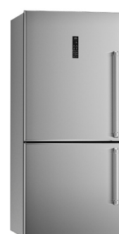
REF31BMXL + MASHK31BM