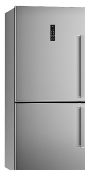
REF31BMXL + PROHK31BM