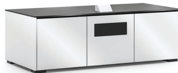
MIAMI – Gloss, Warm White with Black Solid Surface Top X3/EPS2/237S/MM/GW/BK