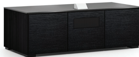
CHICAGO – Black Oak, Grass Texture with Black Solid Surface Top X3/EPS2/237S/CH/BO/BK