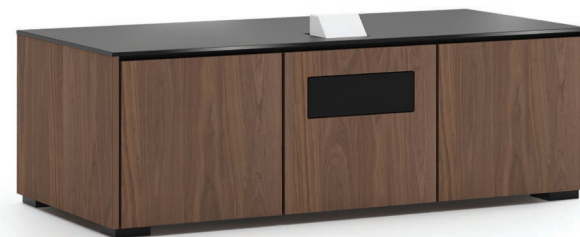
SIENA – Medium Walnut with Black Solid Surface Top X3/EPS2/237S/SN/MW/BK