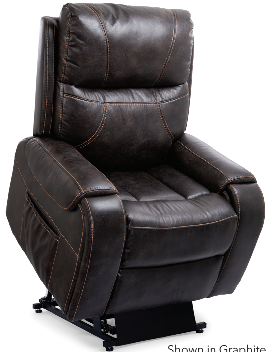
Shown in Graphite

The World's Most Advanced Power Positioning Lift Recliner with Patented Twilight Technology!