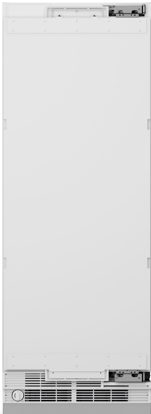
Product: 30 Inch Built-In Refrigerator Column