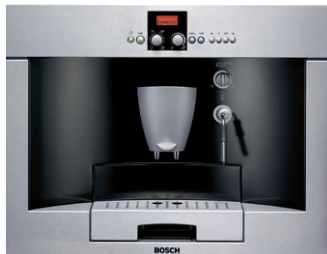
TKN68E75UC Stainless Steel

The Bosch Benvenuto® works equally well with whole beans or preground coffee. Choose the exact size and strength of beverage.