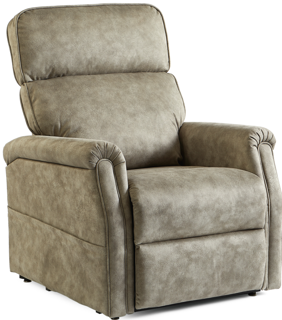
1917-55 in fabric 342-75