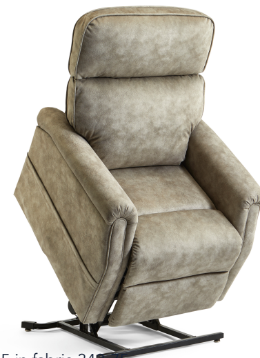
1917-55 in fabric 342-75