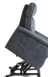
1917-55 in fabric 342-02