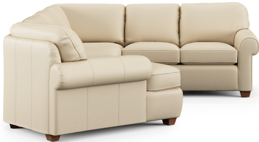
3535-SECT in Leather 824-80