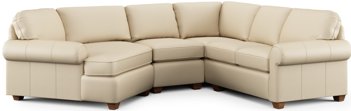
3535-SECT in Leather 824-80