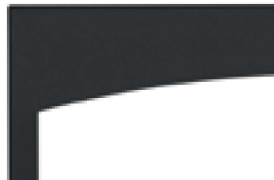
Black Heritage safety barrier