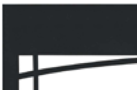
Black Zen safety barrier