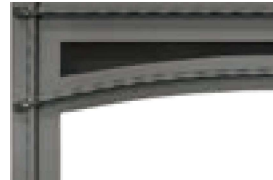
Wrought iron surround