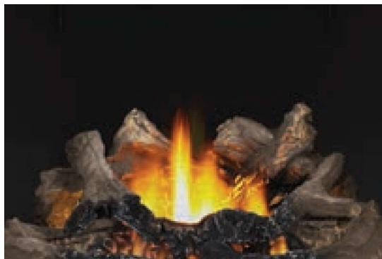
Split oak log set