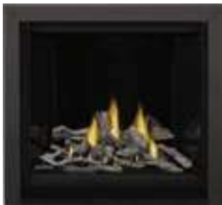
Altitude X | Elevation X