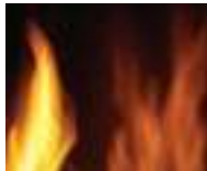
MIRRO-FLAME porcelain reflective radiant panels