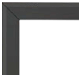
Black 3" bevelled trim