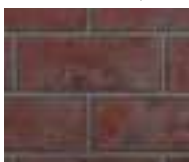
Old Town Red standard