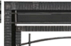
Scalloped wrought iron surround