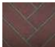
Old Town Red herringbone