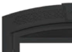
Black surround with safety barrier