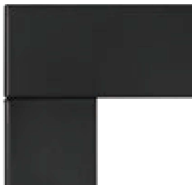
Black 3" trim