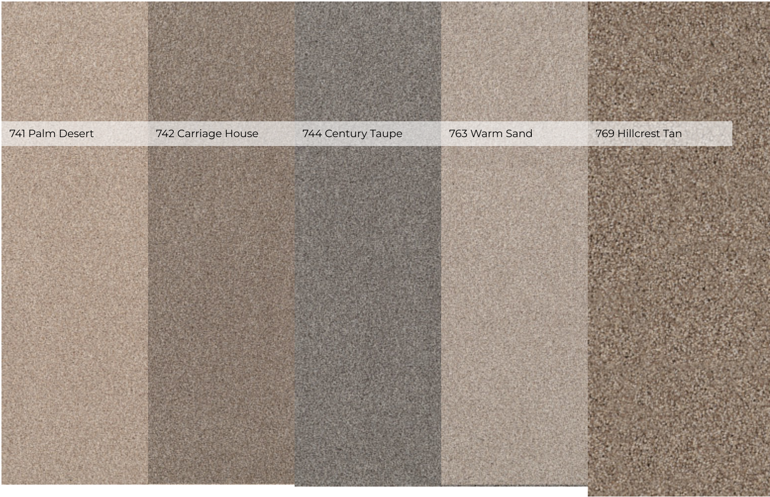
741 Palm Desert 742 Carriage House 744 Century Taupe 763 Warm Sand 769 Hillcrest Tan