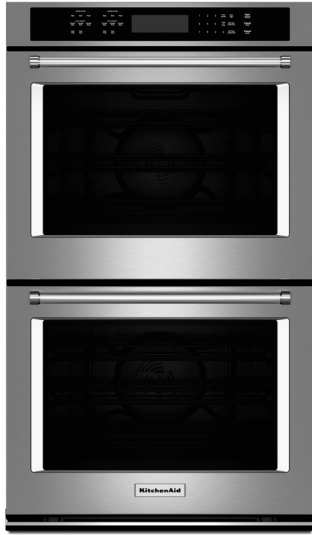
Stainless Steel KODE500ESS