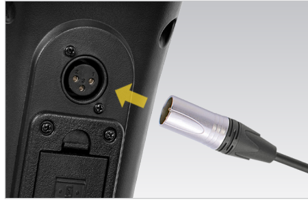
Recharging the Conquest is fast and easy with the charging port located conveniently in the center of the tiller.