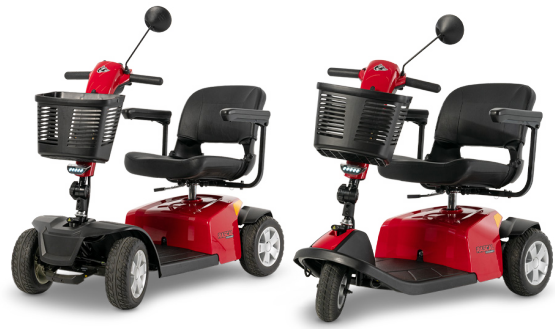
Rascal® Conquest is available in both 3 and 4-wheel models.