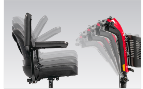
Maximize your comfort with flip-up armrests, adjustable tiller, and seat height adjustment.