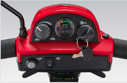
Intuitive controls include speed adjustment, battery meter, key switch, horn, headlight, and forward/reverse throttle.