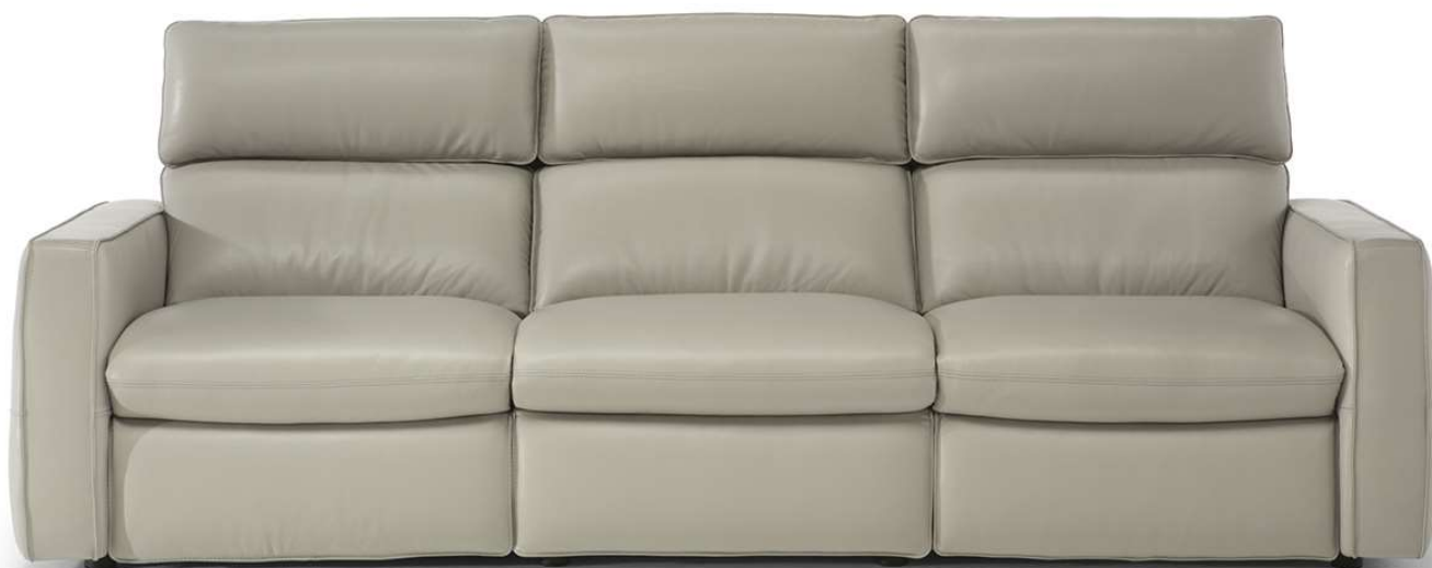
■ Vers. F50+291+F52