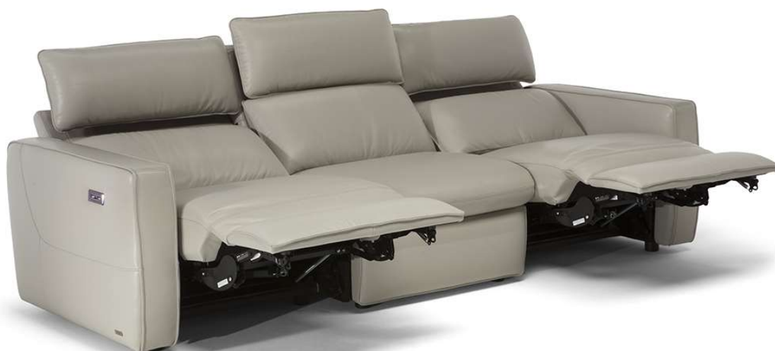
■ Vers. F50+291+F52