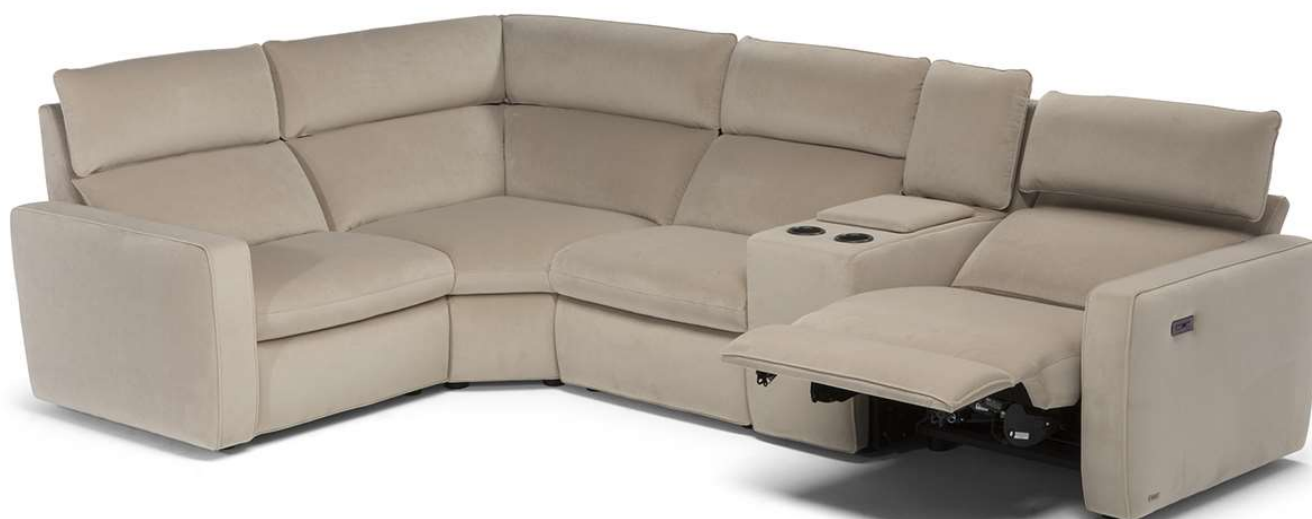
■ Vers. 272+011+291+323+F52