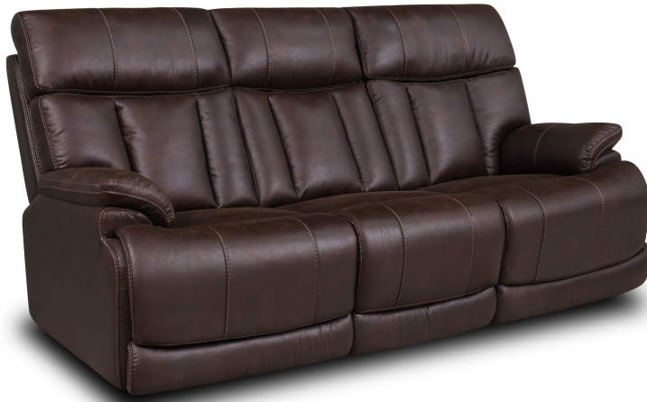
1594-62PH in leather 374-70