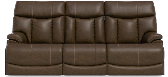
1594-62PH in Fabric 374-70