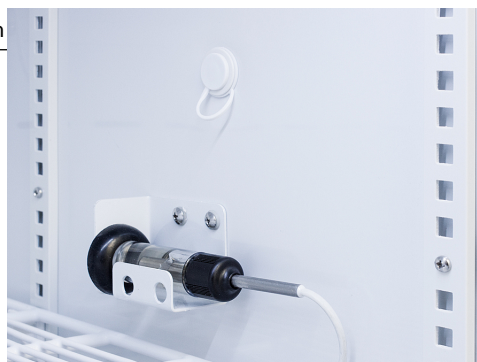
Compressor Step Depth